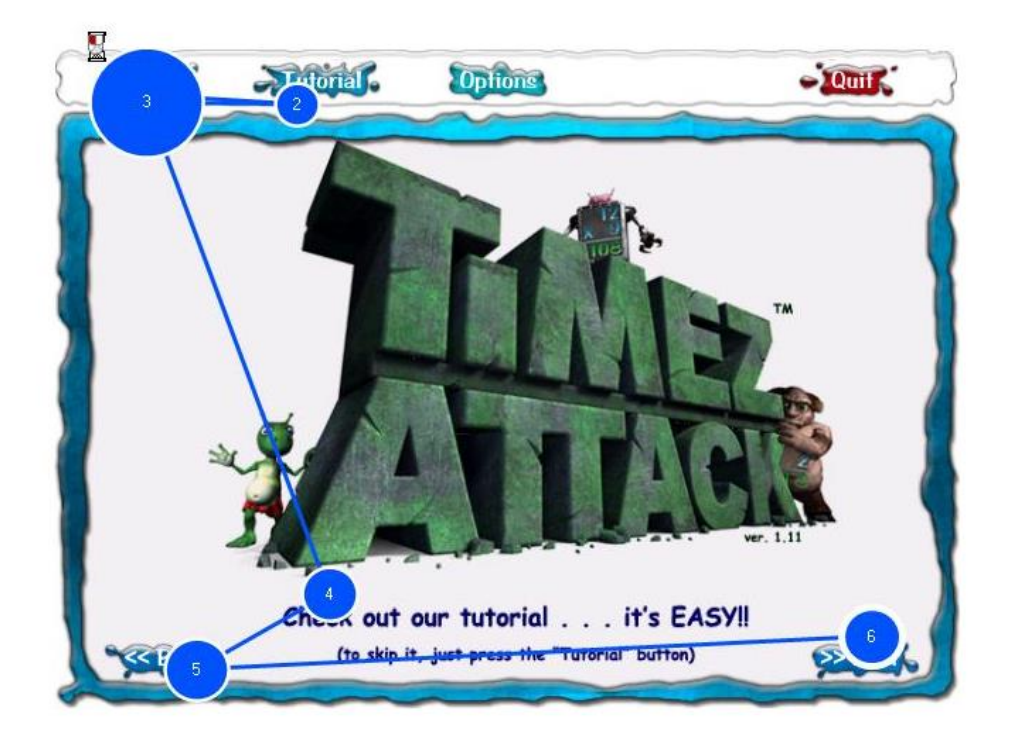
Figure 2 Fixations of a child novice on the opening screen

Children displayed fearlessness when confronted with a new application. They just wanted to get on with it, while most adults first consulted the instructions or tutorials. Eye tracking results revealed that when the application was a game, children immediately searched for the button that would activate the game. In Timez Attack, for example, the longest fixations of child novices were on the Play button at top left on the screen (see Figure 2). Adult participants, by contrast, fixated on the instructions at the bottom of the screen. This particular adult did not look at the Play top left button at all, as shown in Figure 3.