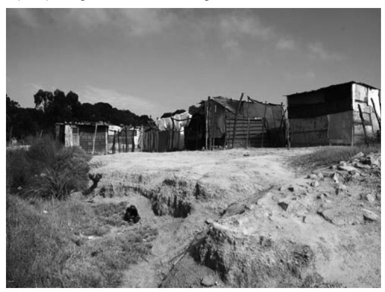
Image 3: Tudor Shaft Informal Settlement which was established by Mogale City Local Municipality, 14 years ago, on uraniferous tailings