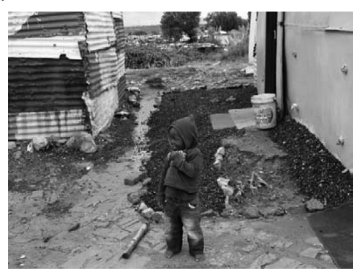
Image 2: Barefoot child standing on uraniferous tailings in the Tudor Shaft Informal Settlement