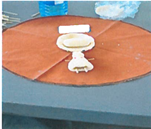
Figure 1: Grinding stone and grandmother

young male made a grinding stone which his grandmother used to grind mielies (maize) which was used to make porridge to feed him.