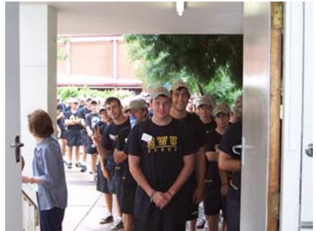
First-year students are waiting for their Library tour.