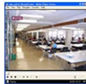
Click here for the information video that was shown to the first year students.