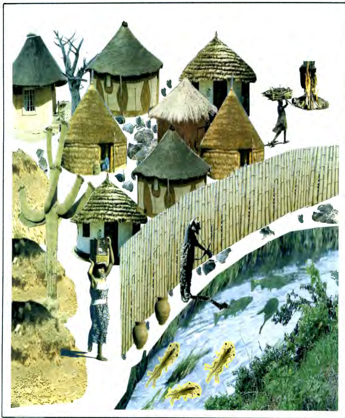
Figure 6.2: Activities in a typical African village (The researcher's interpretation of ecosystems through a typical African village)

Sharing of knowledge and beliefs is not just done by the family but the whole community contributes to the growth and the raring of the learner in the community.