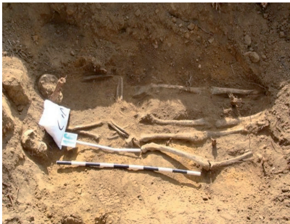
Image 4: The skeletal remains of two of the four individual in situ