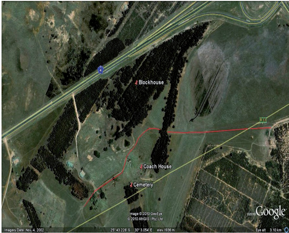
Image 1: Google Earth image indication the location of the cemetery, blockhouses and coach house