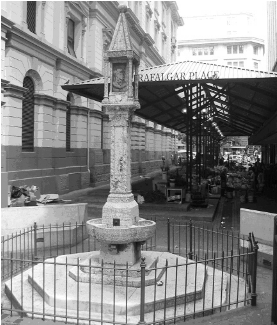
Illustration 5 Fountain from Cape Town.

was operated by hand pumps. Water was lifted by the pumps to an iron water tank with a capacity of about three cubic metres and from there it was distributed through pipes around the castle. Another important well was in the kitchen, equipped with a water tank and also a heating place and tap for hot water. In Cape Town fountains ( Illustration 5 ) were erected in different parts of the town already in 1699, for slaves to draw water for their masters (Report on Cape Town Water Supply by Chas. R Barlow, October 1914, 3/CT, 4/1/1/90, ref F134/4, in Cape Town Archives Depot).