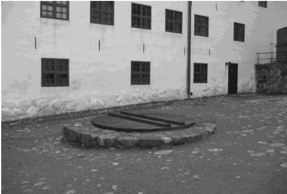
Illustration 6. Well from Turku Castle.

In Finland, Turku castle was founded at the mouth of the Aurajoki River in the 1280s. Finland was a part of Sweden from early 1200s to 1809 and castles built in that era served the administrative purposes of the Swedish Crown. Turku castle was originally built in an open form of a fortified camp and the first well dates back to this era too. When the castle was extended, the kitchen was built around the well and it was kept in use. Up to this day its water is clear and of good quality and this well is considered to be the oldest remaining in Finland. In the early fifteenth century, the fortified camp was built into a closed castle and then it was divided into a main castle and a bailey. ( http://www.tkukoulu.fi/tiimalasi/tl-rakennushist.html ; Gardberg 1959, 7-8) In the mid-sixteenth century Turku castle was found to be old-fashioned, deteriorated and an inconvenient place in which to live. The castle was renovated into a handsome renaissance-style dwelling in 1556–1563 and extended to its current size. Water pipes made of lead and copper were installed from Kakolanmäki hill to the castle and this project took 4000 man-hours in 1561–63. Several more wells were also built to satisfy the increasing need for water. One of them, with timber frame and stone-lined walls is still to be seen in the courtyard (Stenroos & al 1989, 60; Gardberg 1959, 309-310; http://www.nba.fi/fi/turun_linna ; Puhakka & Grönros 1995, 28-29; Gardberg 1961, 7–10). ( Illustration 6 )