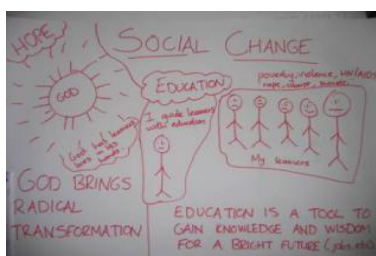
Figure 7: Education as change