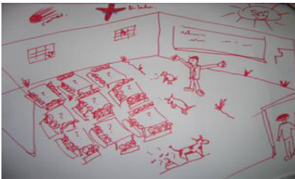
Figure 9: Animals in my classroom